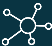
Shared Supplier Pool