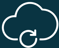
Single Cloud Based Platform

User access is siloed, you see what you are connected to, and tabs organise how you access data in the same manner as a paper folder. Linkages between eTender, LiveAuction and OpenCatalogue offer added benefits with online price file management, CPI management for service rates, all matched with real time benchmarking.